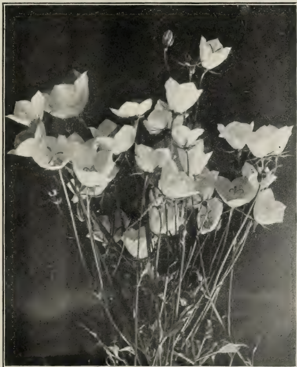
CAMPANULA RAINERI. (See page 10.)